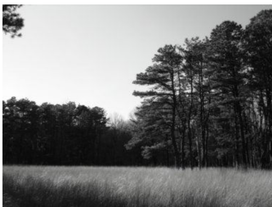
Connetquot State Park, Oakdale, NY

bers of Sophia Garden are becoming interested in beginning to explore how they can eat regionally grown or produced food all year long. We will be initiating a space on our web page this year to help in that endeavor. We are coming home.